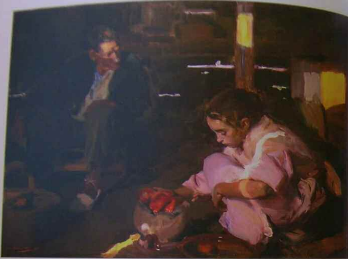
Figures 79-80 JOAQUIN BATISDA y SOROLLA, Hispanic Society of America For pictures of Joaquín Sorolla's work, call (212) 926-2234 or visit: www.hispanicsociety.org.

sit for hours and hours reading in search of knowledge.