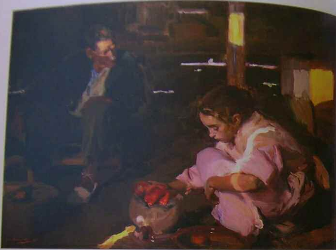
Figures 79-80 JOAQUIN BATISDA y SOROLLA, Hispanic Society of America For pictures of Joaquin Sorolla's work, call (212) 926-2234 or visit: www.hispanicsociety.org

sit for hours and hours reading in search of knowledge.