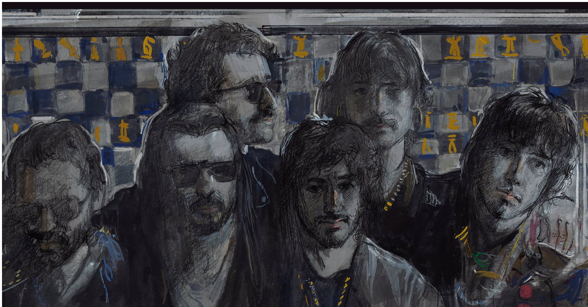
Julian Casablancas and The Voidz, Album cover Painted by Samuel Adoquei

I changed my mind many times, I started with an oil painting but thought the qualia sensation was not effective enough then I did a drawing, the same feeling happened followed by lots of changes, Like the Tyranny album, layers upon layers, all coming together to form a certain well thought out, organized designed and engaging feeling: Complex effect that can only be felt by looking at the image. Believe it or not a qualia touch was what I aimed for. I took my own medicine from the 7 th Essay, "Inspiration in disguise."